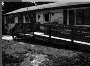
Ramps, lifts and Elevators