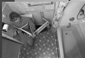
Bath & Bed lifts